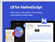
UI for NativeScript