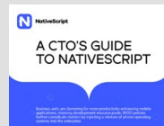
CTO's guide to NativeScript